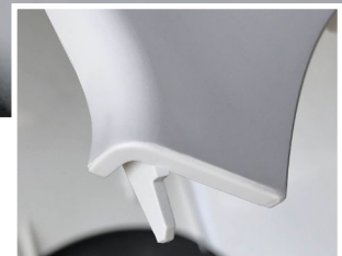
AFTER CLEANING: Part after mold cleaning with Lusin® MC1718