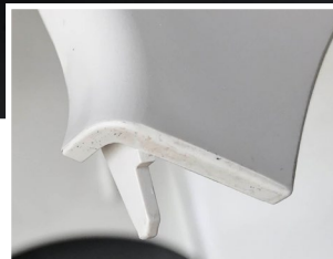
BEFORE CLEANING: Part contamination by mold residues