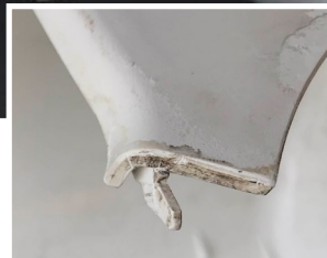
DURING CLEANING: Heavily contaminated part pulled from mold after application of Lusin® MC1718